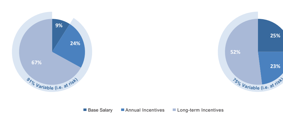
2017 Chairman & CEO Target Compensation Mix