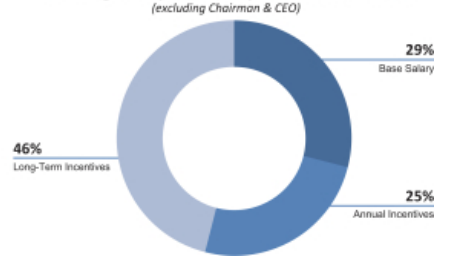
2015 Target Compensation Pay Mix for all other NEOs

NEOs, 100% of the annual incentives and 75% of long-term incentives could be earned only if corporate financial performance goals were met. The remaining 25% of their long-term incentive target was tied directly to shareholder interests and granted in restricted shares tied to our stock price performance.